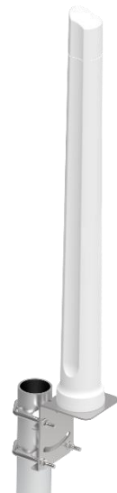
OMNI-293 (or OMNI-493), mounted using the provided 316 Stainless Steel L-bracket